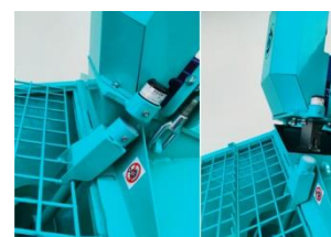
Hopper grate safety sensor.